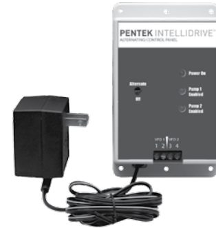
VFD-ALT VFD ALTERNATING PANEL