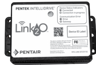
VFD-LINK WIRELESS TRANSLATOR FOR INTELLIDRIVE