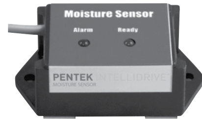
VFD-WS VFD WATER SENSOR WITH 15' CABLE

Pentek Transducer for use with Pentek Intellidrive and Intellidrive XL.